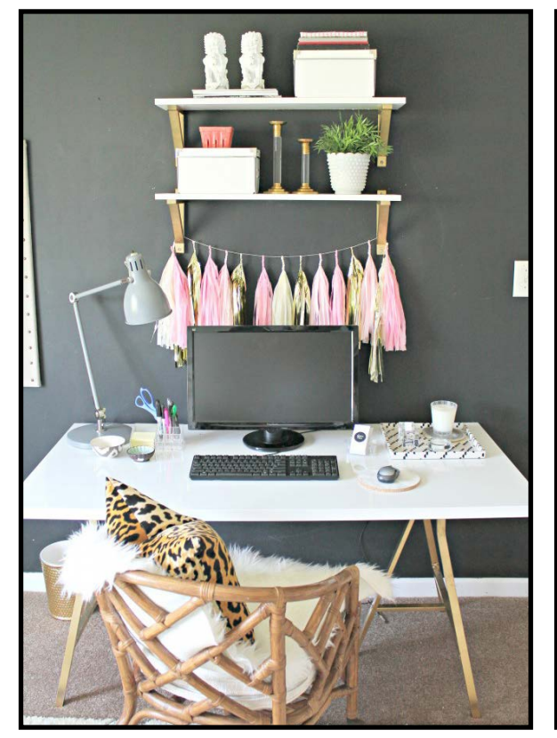
THE OFFICE STYLIST