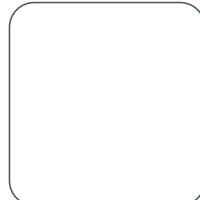
King 76" x 80"