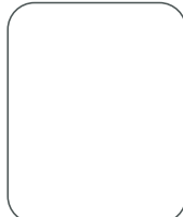
Queen 60" x 80"