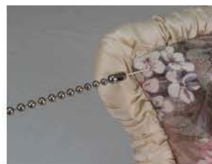
Figure 3. Hook Pillow Form