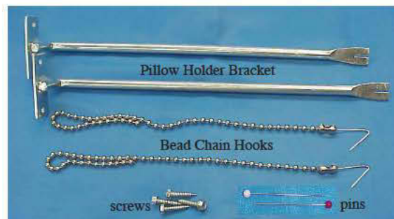
Figure 1. Parts