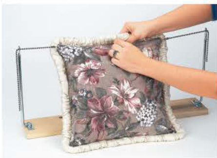
Figure 4. Pillow Form Hooked on the Device