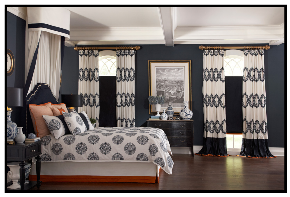
TIP: Don't forget to take a picture of the final product to add to your portfolio!

Steam and dress drapes to complete the project.