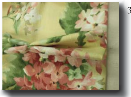
2 Finger Pleats