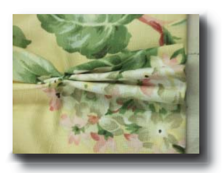
3 Finger Pleat