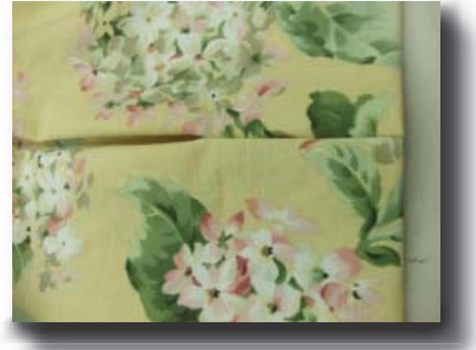
Inverted Box Pleat