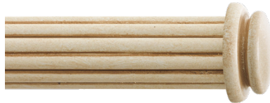
Essex End Cap PO138ESEC 3/4" L x 2" W Resin, Linen