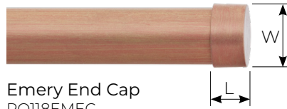
Emery End Cap PO118EMEC 3/4" L x 1 1/4" W Metal, Blush