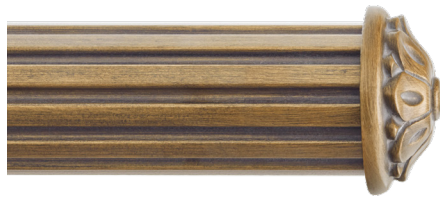
Large Carved End Cap PO214LCEC 1 1/8" L x 2 3/4" W Resin, Mystic