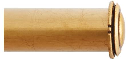
Margot End Cap PO214MAEC 3/4" L x 3" W Resin, Antique Gold Leaf