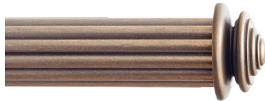
Lowell End Cap PO138LOEC 1" L x 2" W Resin, Spun Gold