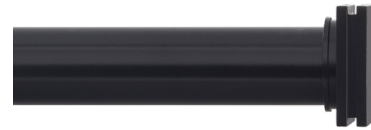
Zane End Cap PO118ZAEC 5/8" L x 2 3/8" W Metal, Black