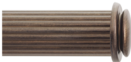
Durham End Cap PO214DUEC 1" L x 3" W Resin, Shimmer