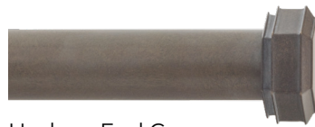
Hudson End Cap PO118HUEC 7/8" L x 1 7/8" W Resin, Barnwood