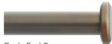
Beale End Cap PO118BEEC 1/2" L x 2" W Resin, Andiron