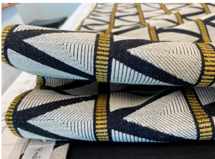
TRANSLUCENT BUCKRAM INSIDE THE HEADER