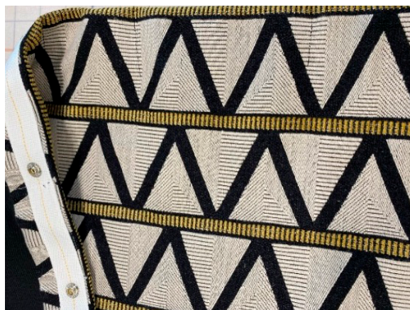
VERY FEW STITCHES SHOWING ON THE FRONT OF THE PANEL